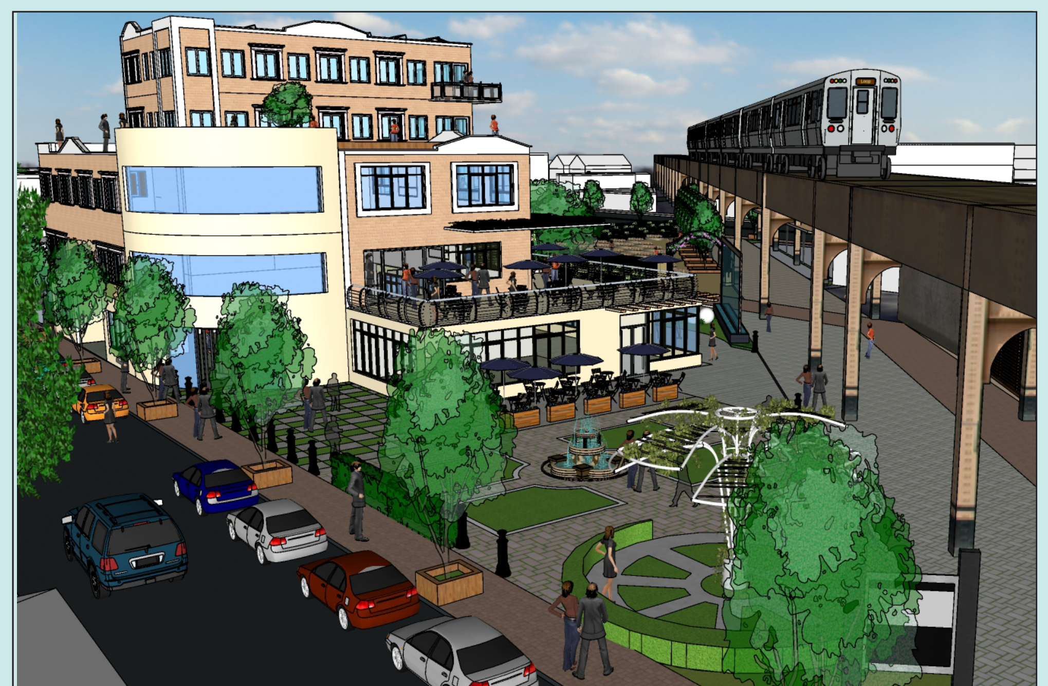
Affordable housing unit with retail stores, green spaces