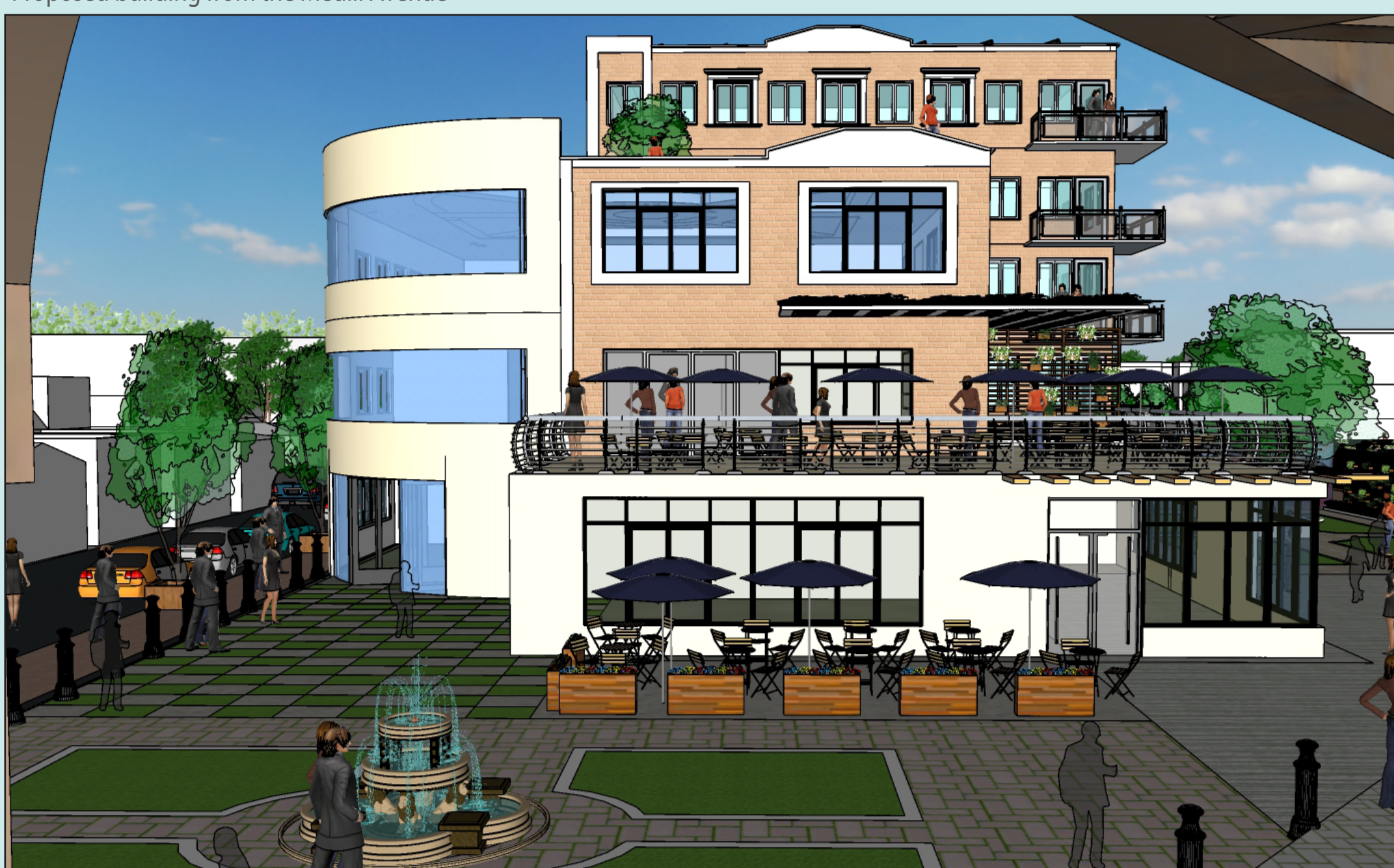
View from the north east side with the commercial/retail stores