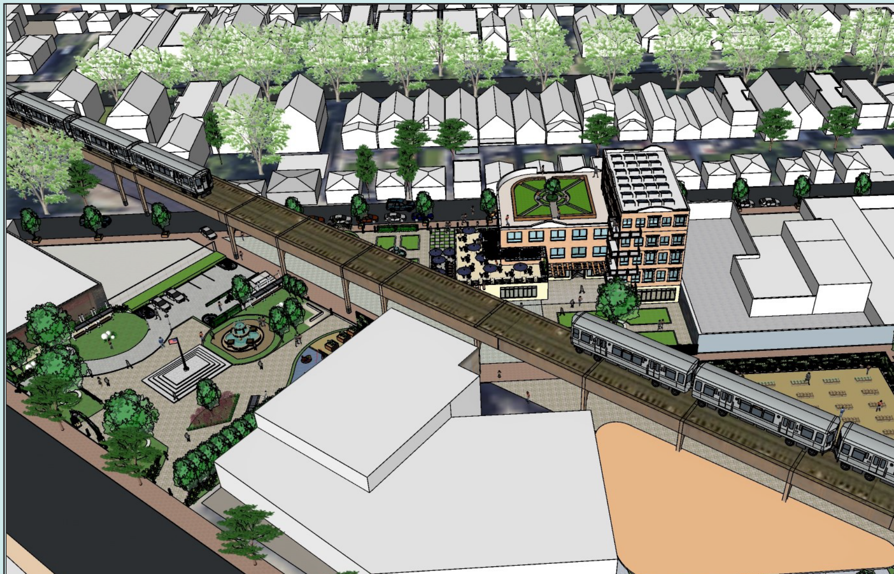
Built environment around the site with the development in the proposed site area