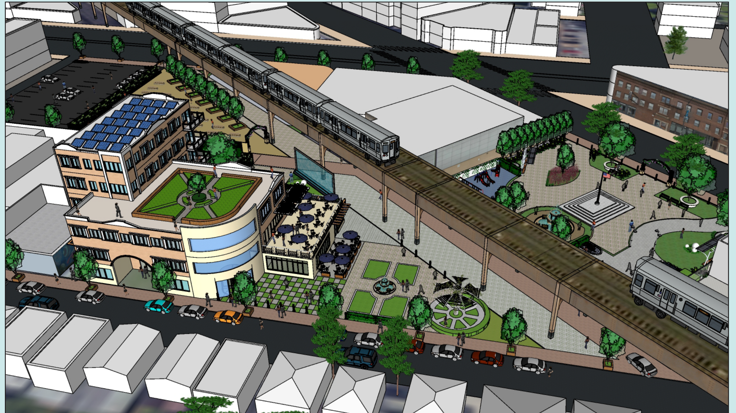
Green space area throughout the site with permeable pavements and the streetscape joining each built environments