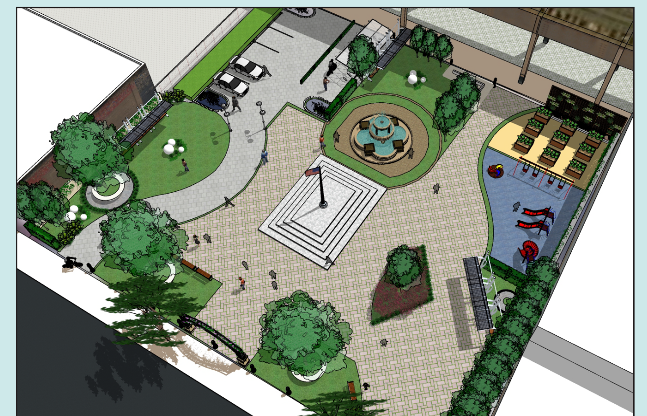
Birds eye view of Community garden with bike track

The lower level consists of the retail stores and cafe and second floor consists of the restaurant and roof top garden. The roof top garden facing towards the Milwaukee avenue gives the vision of the vibrant avenue and the community garden. Rest of the floor areas consists of the affordable housing units focusing the working class residents. Hence, creating sustainable urban environment using the green roofs, solar panels, permeable pavement throughout the site.