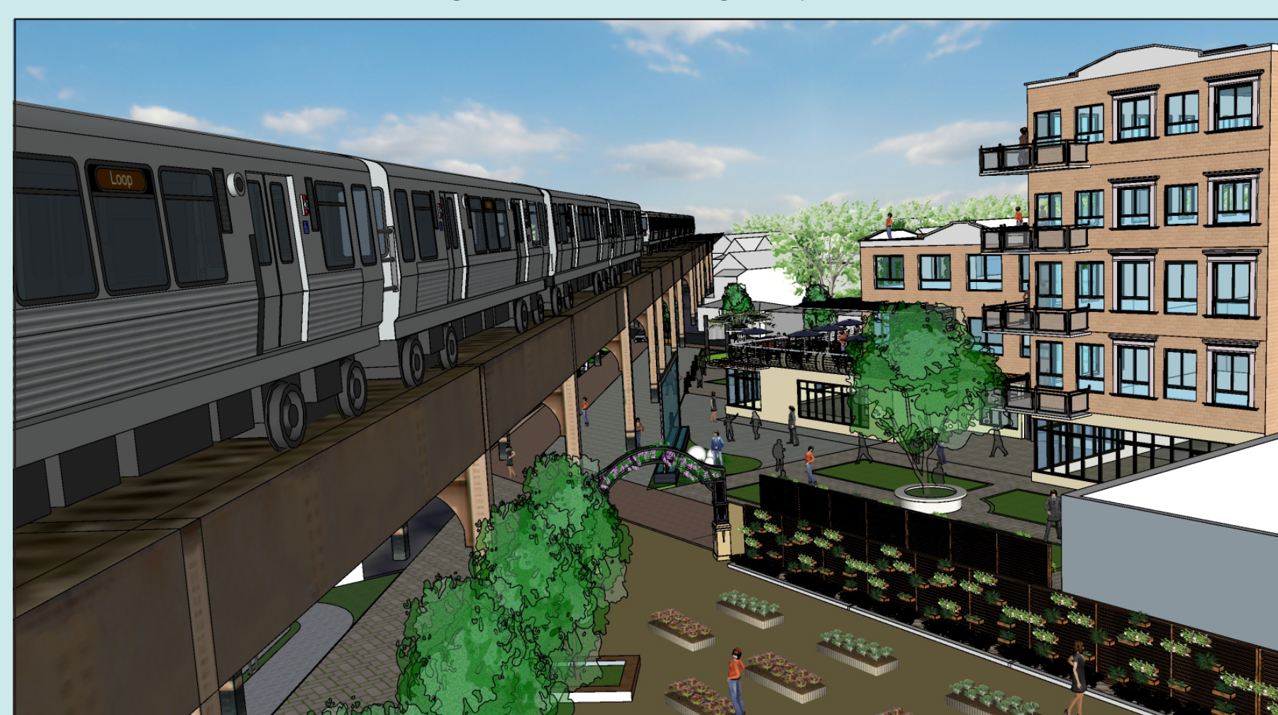
View of the affordable housing and urban farming area

URBAN DESIGN LABORATORY SWETA AMATYA SPRING 2019