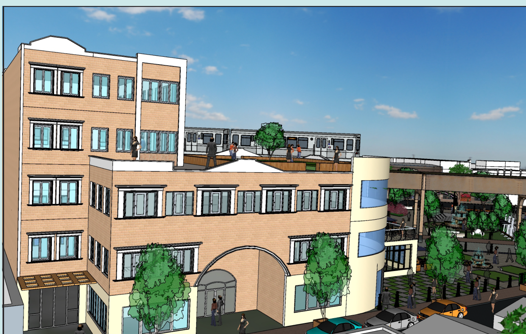
Proposed building from the Medill Avenue

The lower level consists of the retail stores and cafe and second floor consists of the restaurant and roof top garden. The roof top garden facing towards the Milwaukee avenue gives the vision of the vibrant avenue and the community garden. Rest of the floor areas consists of the affordable housing units focusing the working class residents. Hence, creating sustainable urban environment using the green roofs, solar panels, permeable pavement throughout the site.