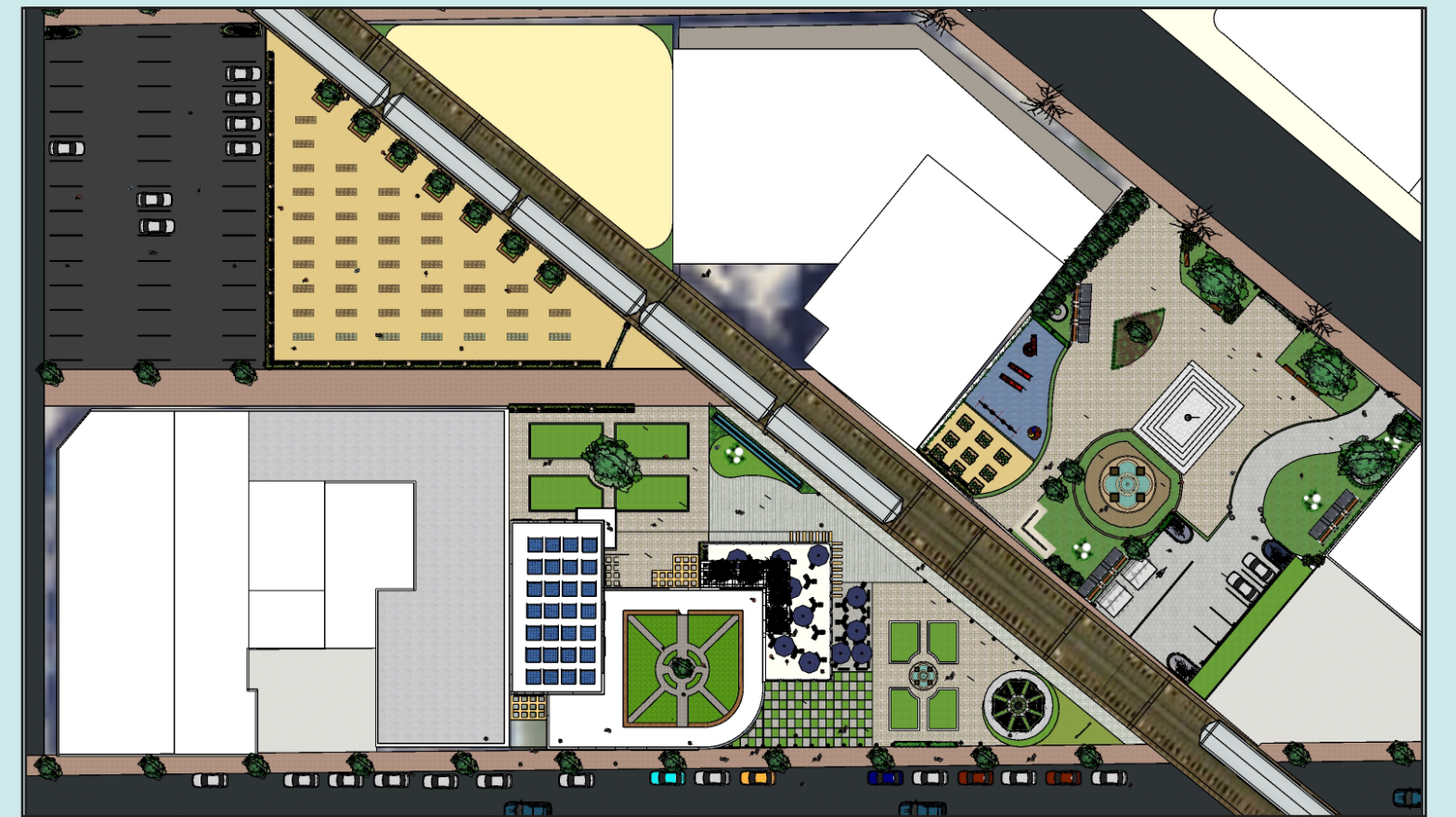
Urban space with affordable housing, community garden, retail stores, urban farming as well as market place.