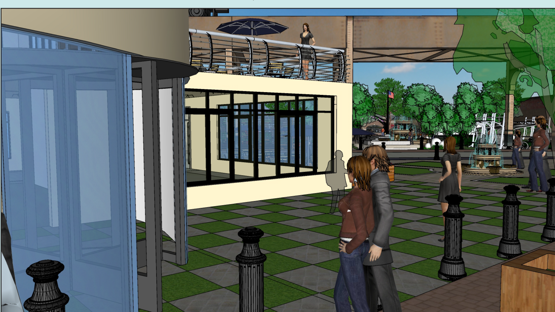
View from the Medill Avenue